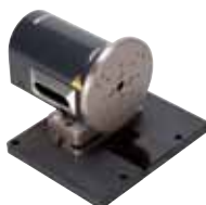
Rotary Table \theta 2-axis Unit